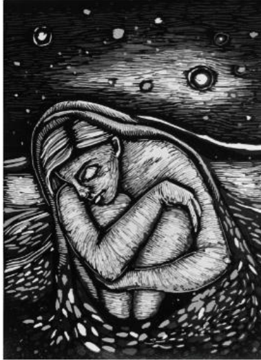
Protective Skin by Rebecca Reynolds. Used by permission.