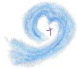
WELCOME GRADE SERVICE LOVE COMMUNITY